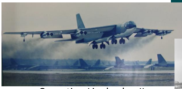
Operation Linebacker II